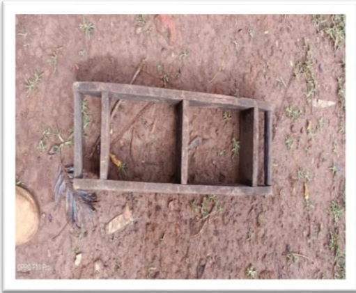
Form for making bricks

All of the grads, under Nick`s supervision, have decided to build their own dorm. They have already built a 4-door latrine. It is ready to be plastered, the doors put on and painted, and then they can tear down the old, old, old latrine which is in bad condition. During December and January, any grad that is free will be making bricks. Over 100,000 bricks will be needed. If they buy the bricks ready-made, it will cost 8 cents a brick plus 250 for transport per ox-cart, 200 bricks. So, we will save us thousands of dollars. They students will dig the foundation in April and start building in August when they are on break. The grads are asking for donations to help them with cement, sand, gravel, doors and windows.