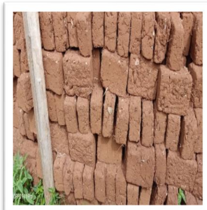
Drying bricks, ready to be baked.